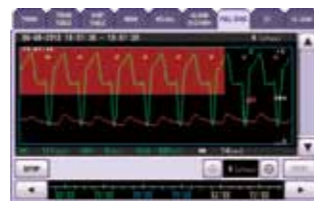
Full disclosure Up to 72 hours of 5 waveforms *transport mode: 24h