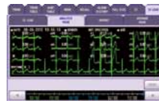
12-lead ECG analysis Includes ECAPS 12 C, the same advanced 12-lead ECG analysis software in Nihon Kohden electrocardiographs.