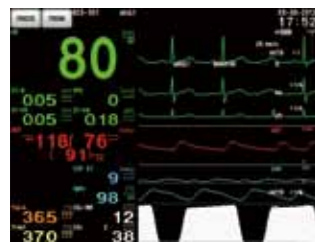
All parameters includes waveforms

The large 5.7 inch screen clearly displays all parameters. MULTI connectors allow flexible parameters and optimal monitoring based on the patient condition. Life Scope PT can also show comprehensive review data including full disclosure that are typically found only in a central monitor.